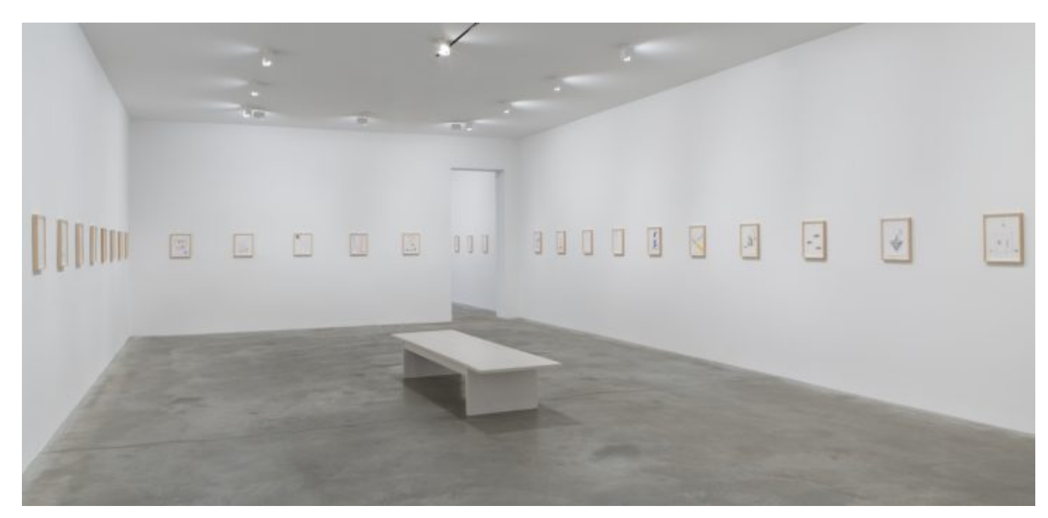
Nayland Blake, "6.1.16" (2016)

Devotees of Blake's inventive body of prior work - sculptures, performances, videos, and drawings that wryly explore themes of gender, sexuality, and race — will spot familiar motifs in these latest drawings. Such references include Blake's gender-fluid bear-bison furry persona, Gnomen; the bric-a-brac of their sculptures; cartoonish floating heads, eyeballs, holes, and phalluses with sadomasochistic undertones. But appreciating the exhibit requires no background or insider knowledge. Whatever their subject matter, the drawings contemplate how art can be used to foster personal habits that nourish artist and audience alike, even — especially — in times of duress.