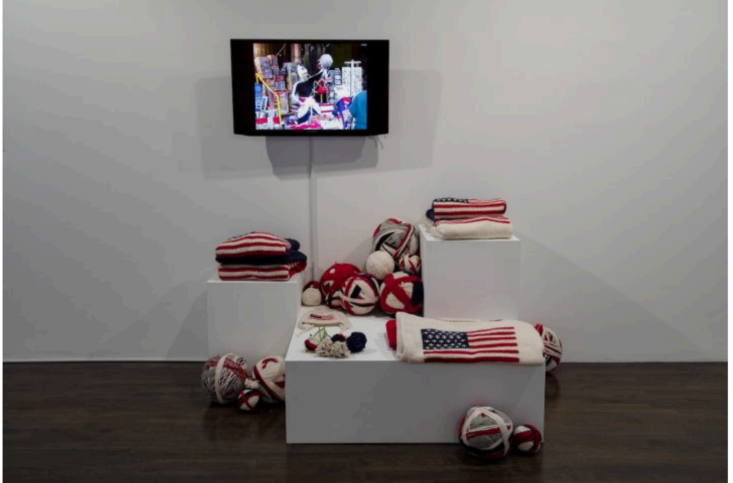
Installation view of "Enacting Stillness (2016), at the Eighth Floor, New York

Yoko Inoue's 2006-2016 "Transmigration of the SOLD" is similarly unassuming and concentrated. For the ongoing performance, Inoue sets up a vendor's stall on Canal Street in New York City's Chinatown where it appears she is in the process of making and selling knitwear containing an image of the American flag. Upon closer inspection, however, it turns out she is not knitting or selling the sweaters but unravelling them. This defamiliarizing move not only confronts the potential customer with a portion of the otherwise occluded history of the product's materials and labor but also constitutes a gesture of artistic self-effacement that could stand as an allegory for the nature of performance art. Just as the sweaters disappear from view, leaving behind only unformed yarn as their trace, so too do live performances vanish — transmigrate — into their documentary afterlives.