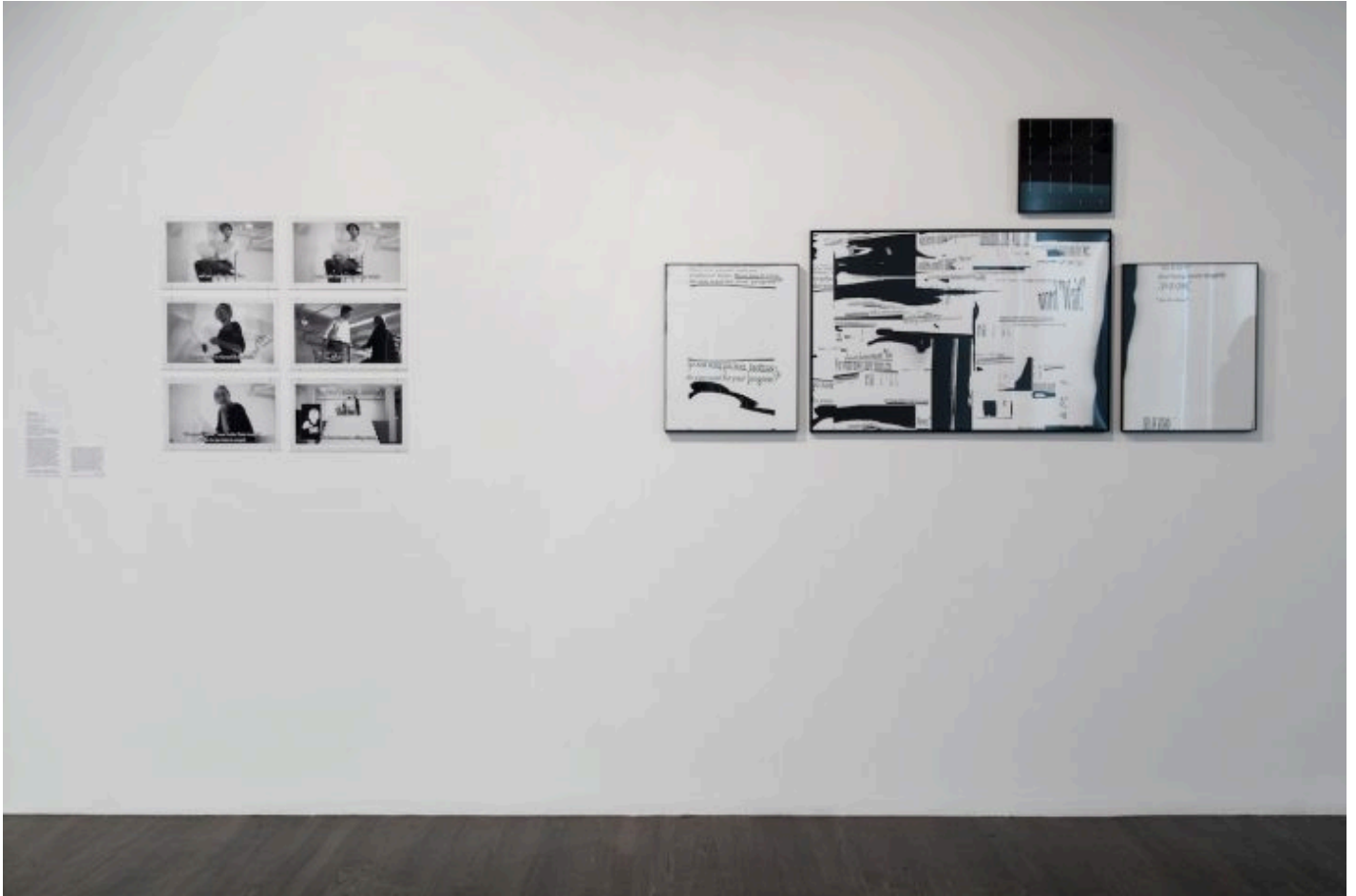
Installation view of "Enacting Stillness (2016), at the Eighth Floor, New York

What the performance can do, however, with perhaps greater effectiveness than any abstract critique, is allow the audience to feel that critique's visceral, lived force. As an experience, therefore, "Maze" was powerful and uncomfortable in a politically productive way. Because the predominantly white audience could walk and sit around the entire 360-degree space of the platform, they not only watched Martiel become entombed in his metaphoric prison, they also watched each other watching the spectacle. In other words, the performance forced audience members, of whatever race, to confront, in an immediate, experiential way, their complicity as bystanders to the scene — and, by implication, to the atrocities of the larger U.S. prison system.