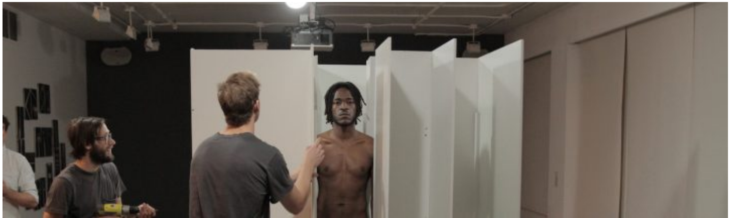
Carlos Martiel, "Maze" (2016)

Despite the fact that almost all commentators on political art warn against the simplistic equation of a work's political contents with its politics, much of the language critics use to describe art's political dimension hinges precisely on the way in which that work's content critiques hegemonic power structures. It's true that you need to be able to point toward and name a political problem in order to apprehend and address it, but the works in Enacting Stillness model a form of political engagement that depends less on content-based critique than on the power of singular experiences. Face-to-face with a compelling, perhaps unusual performance, unexpectedly presented with a quotidian blue rectangle in your Facebook feed, you begin to recognize other possibilities for how the world might be ordered and experienced.