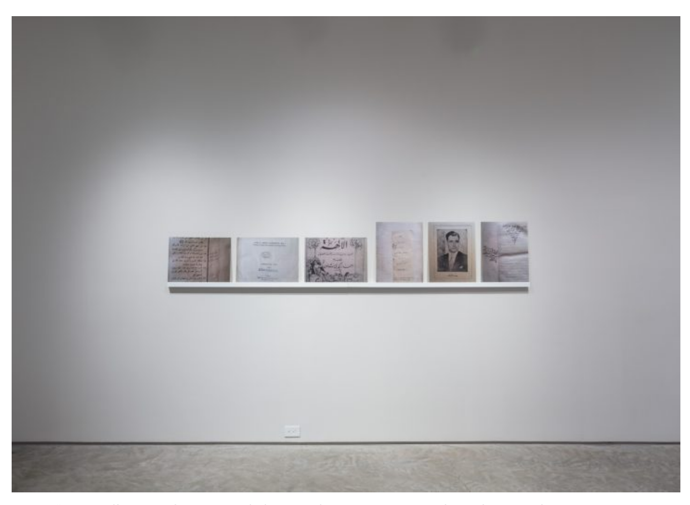
Emily Jacir, "Untitled (fragment from ex libris)" (2010-12), 6 c-prints and shelf, 20 5/8 x 115 3/8 inches

This formative experience of absence inspired the exhibition's organizational premise, whereby contemporary artworks are associatively paired with works that have been destroyed or lost to the annals of art history, for instance, Oscar Muñoz's Re/trato (Portrait) (2004) and Joshua Reynolds's Self Portrait (1637). Nine variously-sized black rectangles, each in the dimensions of the lost artwork, have been painted onto 601Artspace's entryway wall as memorial placeholders. Like nuclear shadows on a Hiroshima wall, this consummately Perecian gallery of black rectangles traces loss's funereal contours.